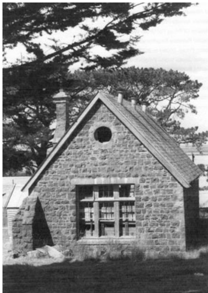
Former Weatherboard School (Back)