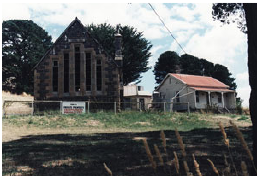
Former Weatherboard School & Residence