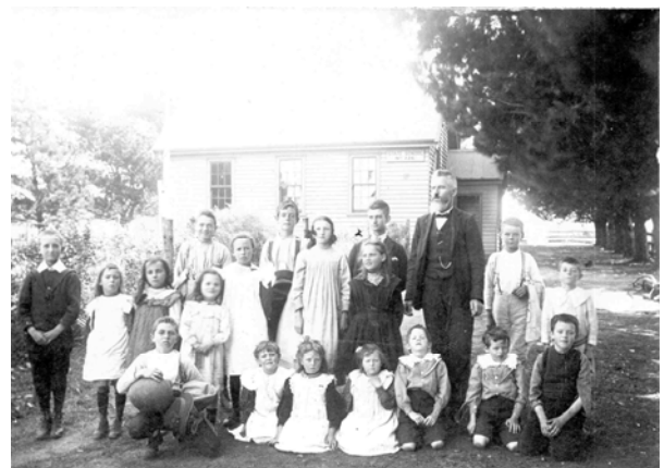
Ercildoune School C. 1908

The original homestead still stands, the hut of two rooms in which Thomas Livingstone Learmonth lived for two years while the building of the house progressed, the woolshed first built at Buninyong of blackwood timber and moved in 1838 in sections to its present site. The house was built of granite from a neighbouring hill, the bricks made of clay close to the site, started in 1840, additions made, but not finally completed until 1858. It embraces the features of Scottish architecture of the Earlston (Ercildoune) district of Scotland, including a replica, on a reduced scale, of the Rhymer's Tower.