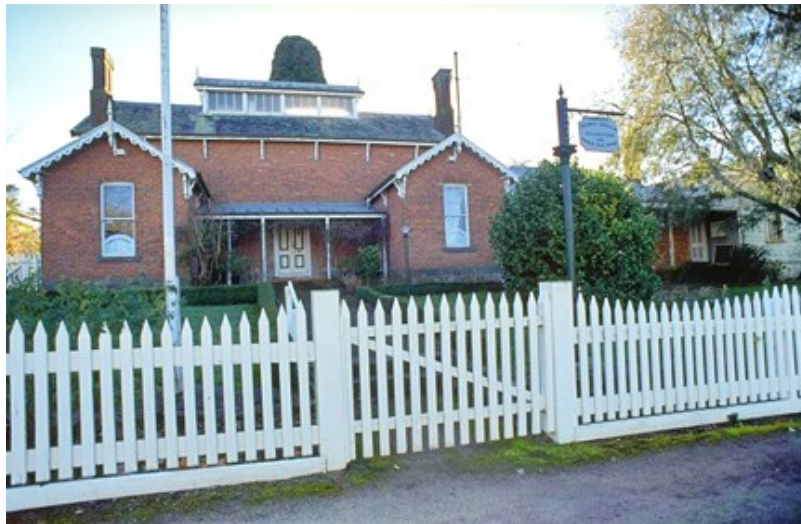
OLD SHIRE OFFICES, 326 HIGH STREET, LEARMONTH.

FOUNDED 1983. INCORPORATED 13/10/1986. INCORPORATION No. A 11213.