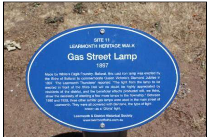
The Gas Street Lamp out the front of the Old Shire Offices

The City of Ballarat have replaced all the 37 markers on our “Heritage Walk,” with new larger and colourful signs, including a QR code which allows people with a smart phone to view further details via the society’s website. www.learnmonthdhs.com.au