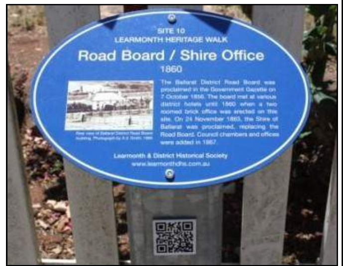
The plaque outside the Old Shire Offices.