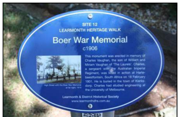
The Boer War Memorial