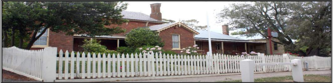
326 High Street, Learmonth, Victoria, 3352

FOUNDED 1983. INCORPORATED 13/10/1986. INCORPORATION No. A 11213. ABN No. 22 133 588 072.